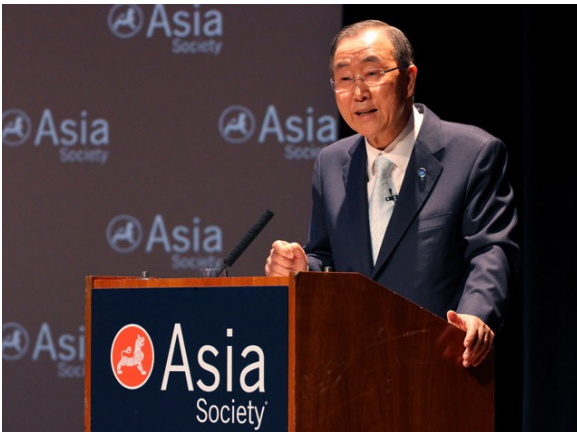
UN Secretary-General Ban Ki-moon at Asia Society New York on June 20, 2014.

June 20, 2014 - With no sign of an end to the Syrian war, and the specter of full-blown sectarian conflict now looming in the region, UN Secretary-General Ban Ki-moon called for the Security Council to impose an arms embargo on Syria, as part of a six-point plan to deal with the crisis and the humanitarian horrors it has produced.