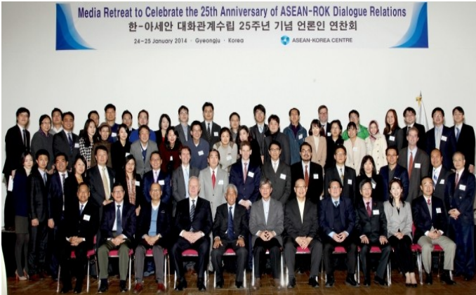
Participants of the Media Retreat Hilton Hotel, Gyeongju

The ASEAN-Korea Centre hosted a 'Media Retreat to Celebrate the 25th Anniversary of ASEAN-ROK Dialogue Relations' on 24 (Sat.)-25(Sun.) January at the Hilton Hotel in Gyeongju. The retreat was attended by over 60 participants, including Ambassadors and other high-level diplomats in Korea from the East Asia Summit (EAS) participating countries including the ASEAN member states, as well as journalists and Korea's major media outlets. The retreat was organized to celebrate the 25th anniversary of the ASEAN-ROK dialogue relations and the 5th anniversary of the inauguration of the ASEAN-Korea Centre.